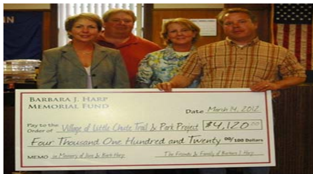
(Harp Family Members)

The Little Chute Parks Department recently received a generous donation from the Harp family. The funds were used to purchase and install five benches along the newly paved walking trail from Island Park to Heesakker Park. Thanks to the Harp family, many walkers will be able to take time to sit and enjoy the beautiful scenery at the park.