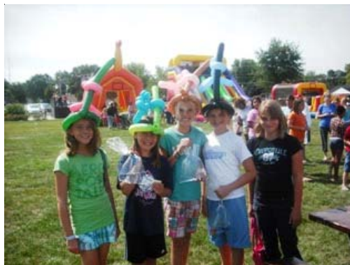
(2009 Summer Carnival)

Come join all the fun at our annual outdoor tot lot carnival which will be held at Legion Park from 11am