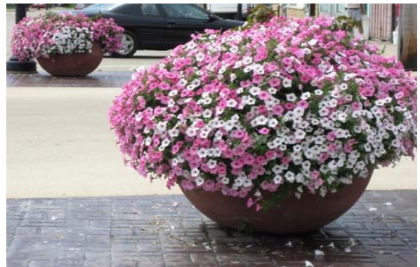
(Downtown Planters planted and cared for by the Little Chute Garden Club)

For more info contact Hollie at LCartsclub@yahoo.com